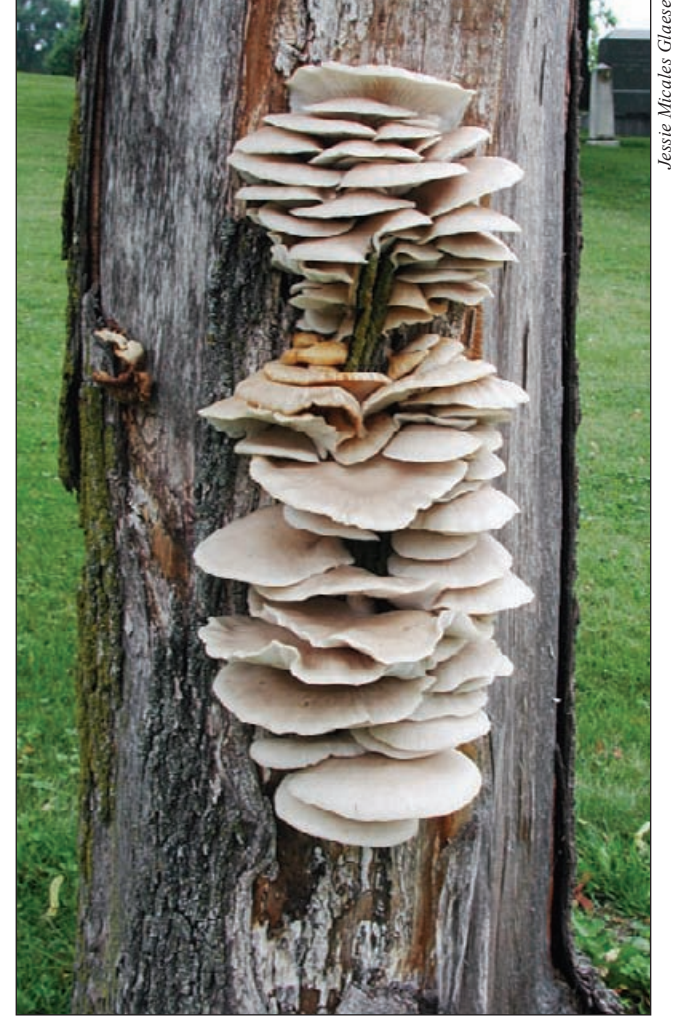
Fruiting body of the oyster mushroom ( Pleurotus ), a common wood decay organism.

Dead wood can represent a substantial fraction of stored carbon in forest ecosystems, and decay rates of coarse woody debris may be affected by climate change. Kueppers and others (2004) found