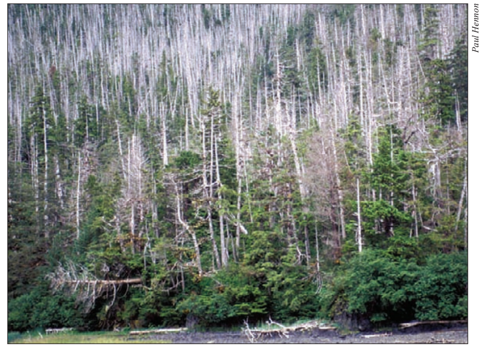
Decline of yellow-cedar on western Chichagof Island in southeast Alaska.