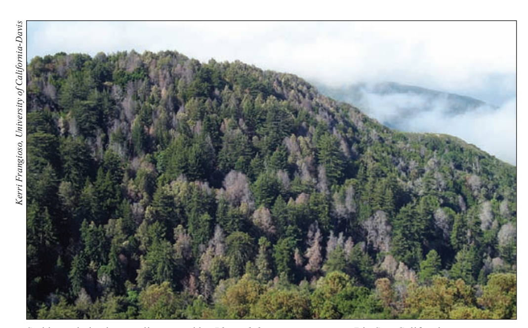
Sudden oak death mortality caused by Phytophthora ramorum near Big Sur, California.

infect roots. The pathogen is currently present but has limited effects in conifer forests of the Pacific Northwest. Although Douglas-fir is susceptible to the pathogen, the winter months are currently too cold for effective zoospore production and infection, and the summer months are currently too dry (Roth and Kuhlman 1966). If, as projected, winters in the Pacific Northwest become