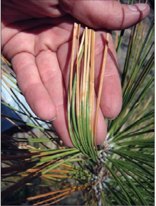
Salt damage on Jeffrey pine, Pinus jeffreyi.