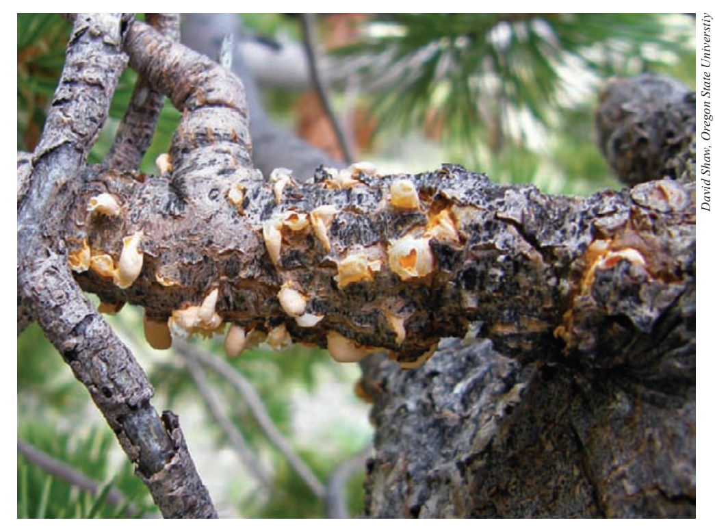
Aecia appearing on whitebark pine in the Wallowa Mountains, Oregon, in late July 2009.