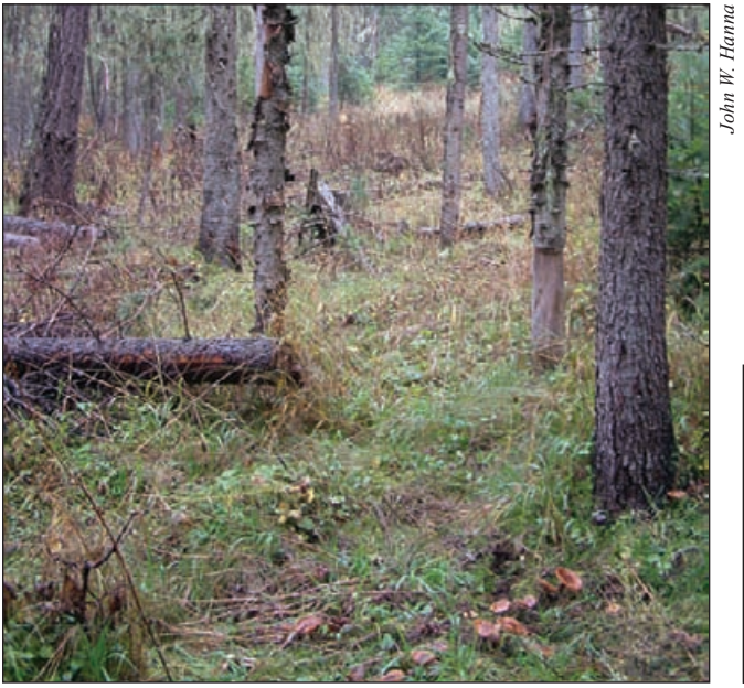
Armillaria root disease mortality center in northern Idaho.