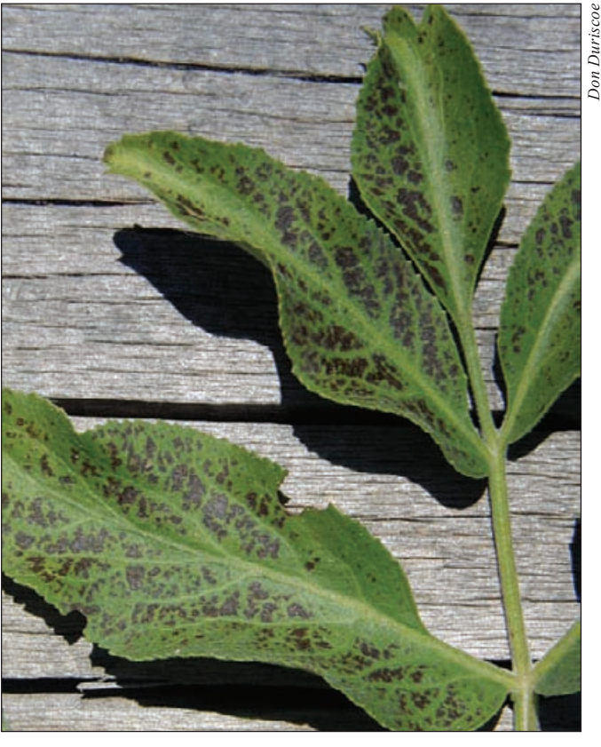
Ozone injury on blue elderberry, causing interveinal necrosis.

The incidence of abiotic diseases associated with environmental extremes is expected to increase as climate changes, as are diseases caused by interactions between biotic and abiotic agents (Boland and others 2004). Mortality of seedlings and saplings is a likely consequence of severe drought. Mature trees are less vulnerable to water limitation because they have deep roots and substantial reserves of carbohydrates and nutrients. However, severe or prolonged drought may render even mature trees less resistant to insects or disease (Hanson and Weltzin 2000, Joyce and others 2001).