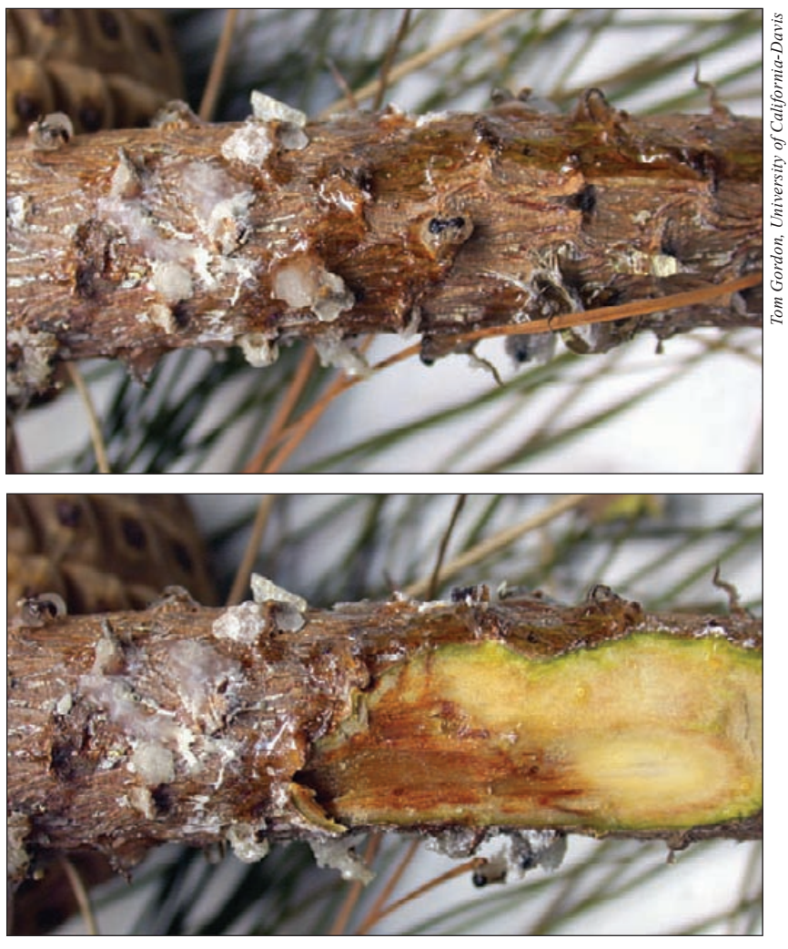
Closeup views of a resin-soaked pitch canker lesion caused by Fusarium circinatum on Monterey pine, Pinus radiata , from a tree in coastal California near Monterey.

Climate change may increase the incidence of many canker diseases. Most canker-causing fungi benefit from heat and drought stress to forest and urban trees (Boland and others 2004, Broadmeadow 2002, Lonsdale and Gibbs 2002, Schoeneweiss 1975). For example, incidence of Sphaeropsis sapinea on pines is likely to increase as drought becomes more common. The incidence of some other canker pathogens, such as Thyronectria austro-americana (Speg.) Seeler on honeylocust ( Gleditsia triacanthos L.) and Cryphonectria cubensis Bruner on Eucalyptus spp., may decrease as climate changes. Incidence of these pathogens is associated with high rainfall, and their hosts display some resistance to drought stress (Despres-Loustau and others 2006).