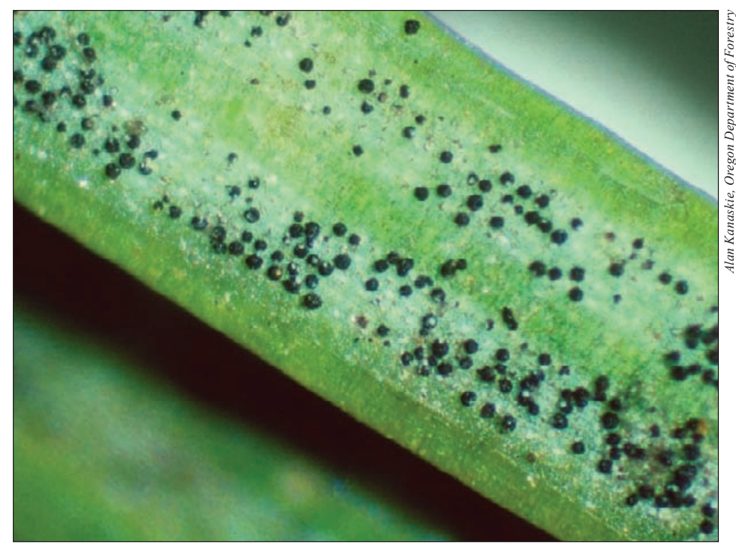
Black fruiting bodies of the Swiss needle cast fungus, Phaeocryptopus gaeumannii , on the underside of Douglas-fir foliage.

geographic variation in disease severity. Although the authors could not project changes in disease severity based on winter mean daily temperature, they detected a relationship between recent regional climate patterns and the observed increase in the disease. Average temperatures for the period from January to March have increased by approximately 0.2 to 0.4 °C per decade since 1966 in the coastal area of Oregon and Washington. In New Zealand, where Douglas-fir is not native, winter mean temperature was the climate variable most closely correlated with severity of disease caused by P. gaeumannii , accounting for about 80 percent of the variation (Stone and others 2007).