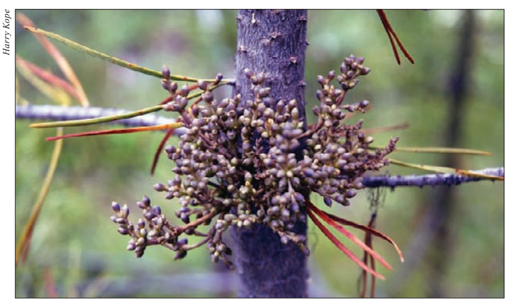
Lodgepole pine dwarf mistletoe.