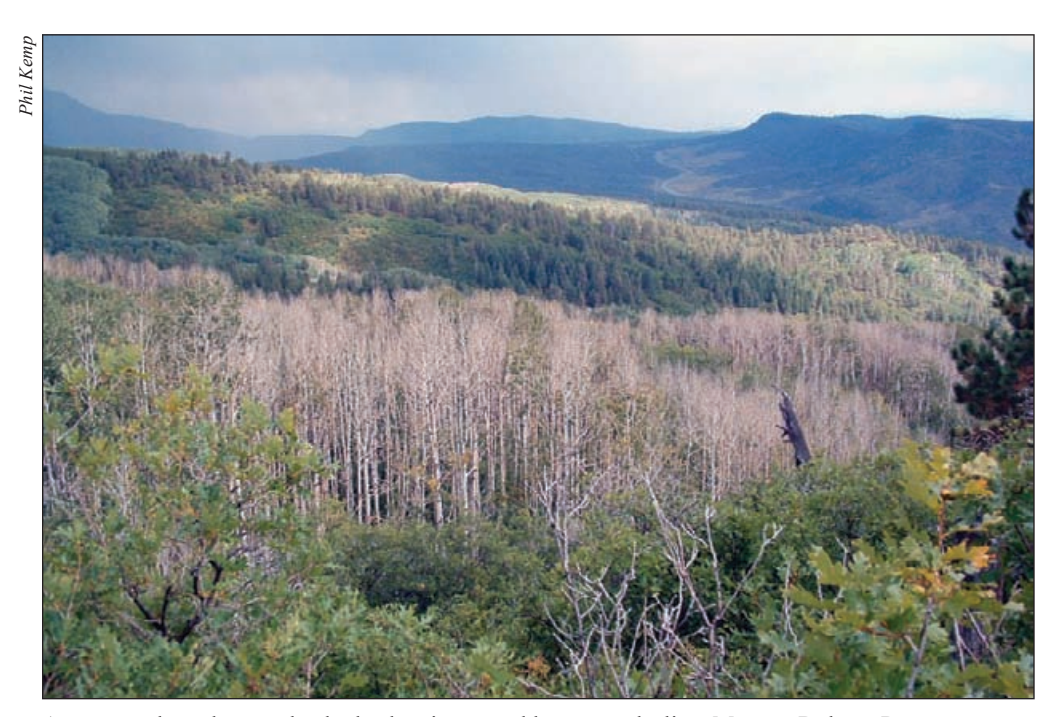
Aspen stand nearly completely dead owing to sudden aspen decline, Mancos-Dolores Ranger District, San Juan National Forest, Colorado.

temperature higher than during the past 280 years (Leaphart and Stage 1971). Thus, drought was an inciting factor in the pole blight, with shallow soils the predisposing factor and secondary fungi contributing factors.