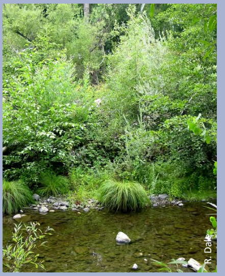
Lush riparian plants of all sizes and forms including grasses and sedges, shrubs, vines, and trees colonize floodplains

Climate change will likely mean warmer and drier conditions overall, as well as more extreme weather. In winter we can expect more frequent and higher floods and perhaps colder cold snaps. In summer we can expect longer droughts and hotter heat waves. One of the effects of high summer temperatures will be less water remaining in the ground by the end of the growing season.