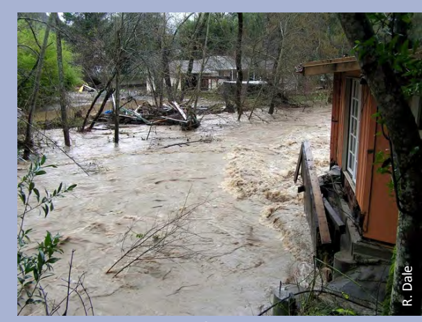
The December 31, 2005 flood on Sonoma Creek in Glen Ellen, CA