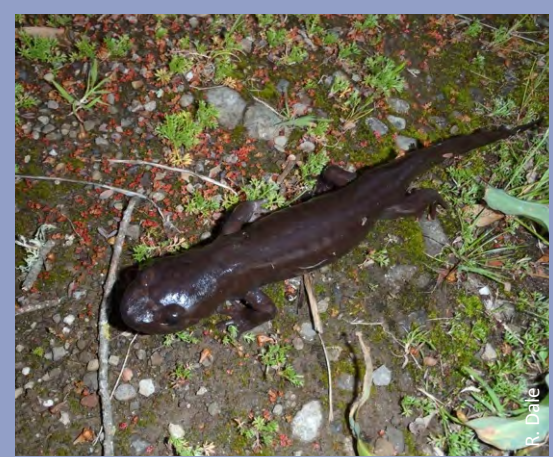
The California Giant Salamander is dependent on movement corridors, particularly along streamside forests. This one was photographed at Van Hoosear Wildflower Preserve, near Sonoma, CA

Climate change will not only stress our human communities and built infrastructure, but will also threaten the incredible biodiversity of our region. By enhancing the habitat of your stream-side property you will create a refuge for many threatened plants and animals.