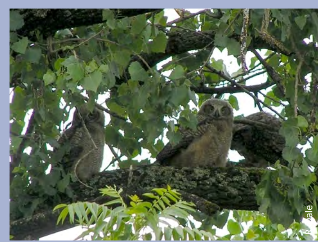
Great Horned Owls fledged from a nest in a dead Fremont cottonwood along Sonoma Creek near Glen Ellen, CA

Animals depend on streamside areas not just for food and shelter, but also to travel.