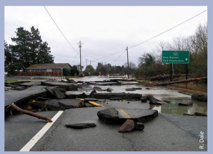
Damage from the December 31, 2005 flood, between Schell and Sonoma Creeks in Schellville, CA at Highways 121 and 12